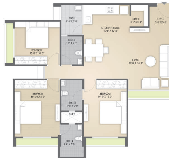
3 BHK UNIT FLOOR PLAN